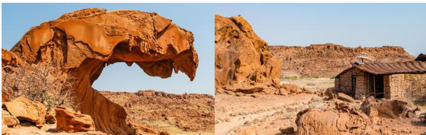
table mountain. It was this spring that attracted Stone Age hunters over six thousand years ago, and it was during this time that the extensive group of rock engravings and paintings were produced. Visitors can look forward to basing themselves at some wonderfully shady campsites along the Aba-Huab riverbed, while exploring over thirty different sacred ritual sites of the traditional hunter-gatherer communities.